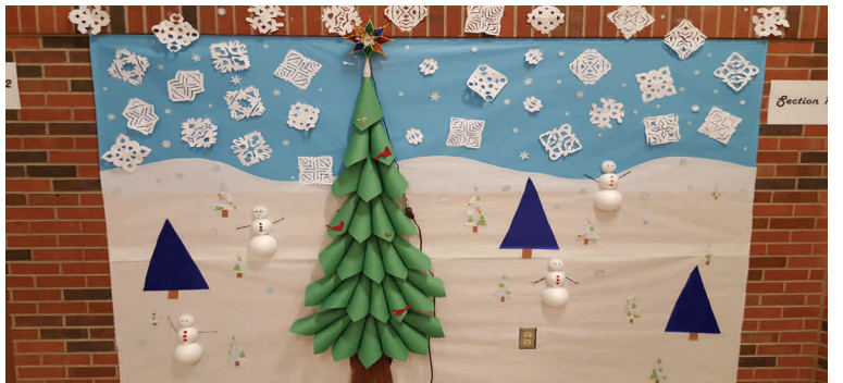
Best Christmas Tree Award