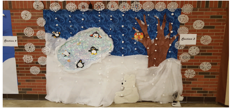
The Best Special Effects Award