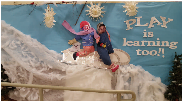
The Best 3D Award