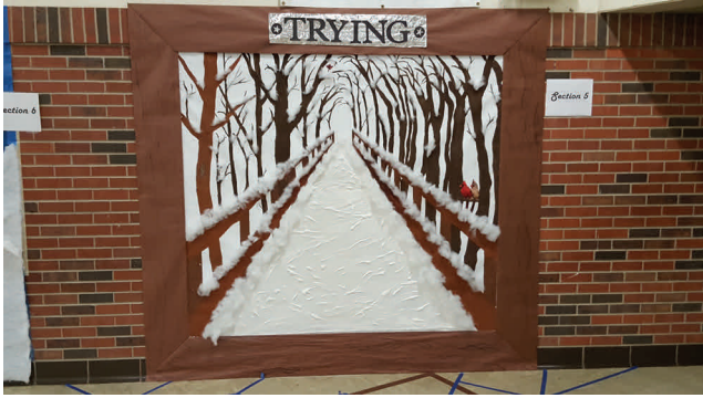
The Most Realistic Award GRAND PRIZE WINNER