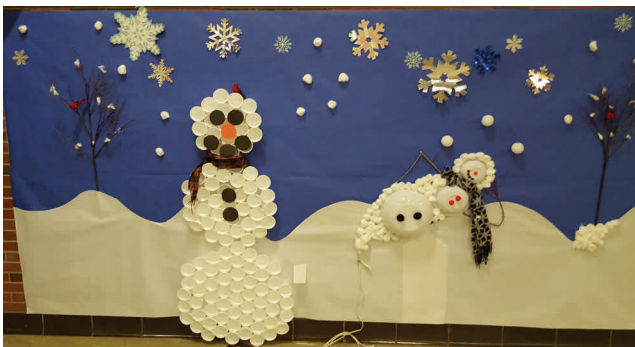
The Winter "I Wish I Was On The Beach Somewhere" Award