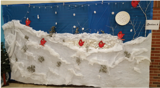
The Cardinal Spirit Award