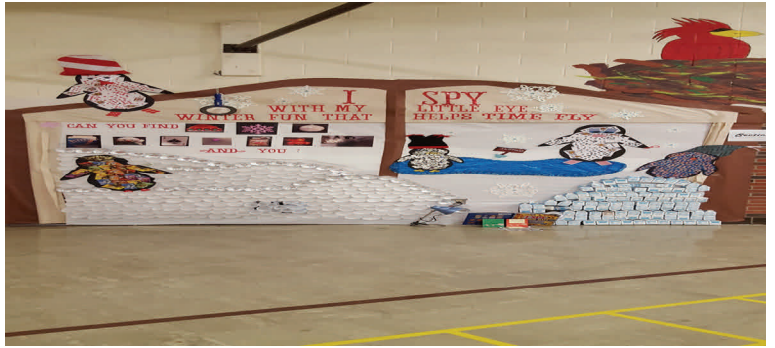
The Student Inclusion Award