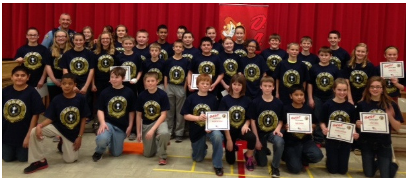
6th Grade D.A.R.E. Graduation