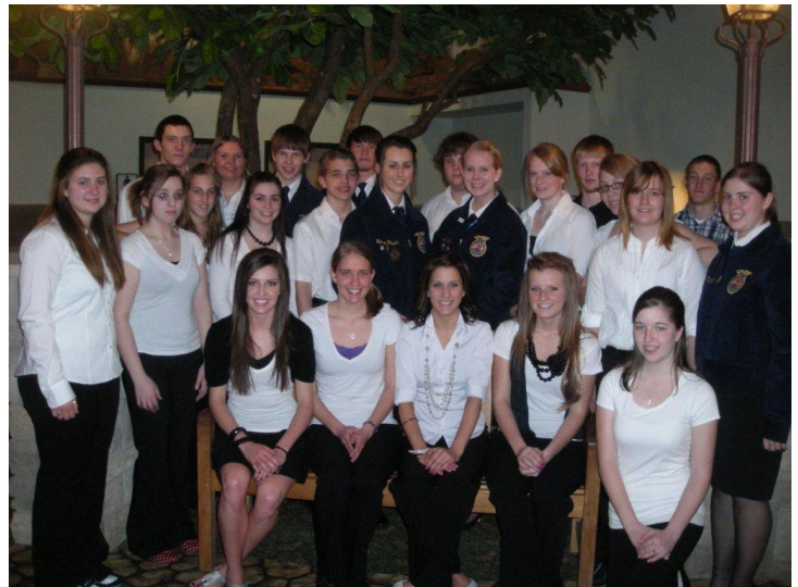
The National Honor Society members that served the meal at the Cardinal Foundation Fundraiser.