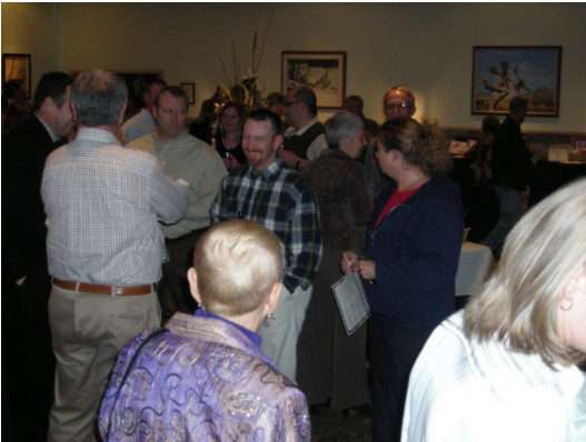
Attendees viewing Silent Auction items and enjoying some social time.