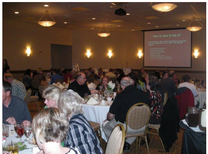
Attendees enjoying the delicious meal and sharing conversation at the Cardinal Foundation Fundraiser.