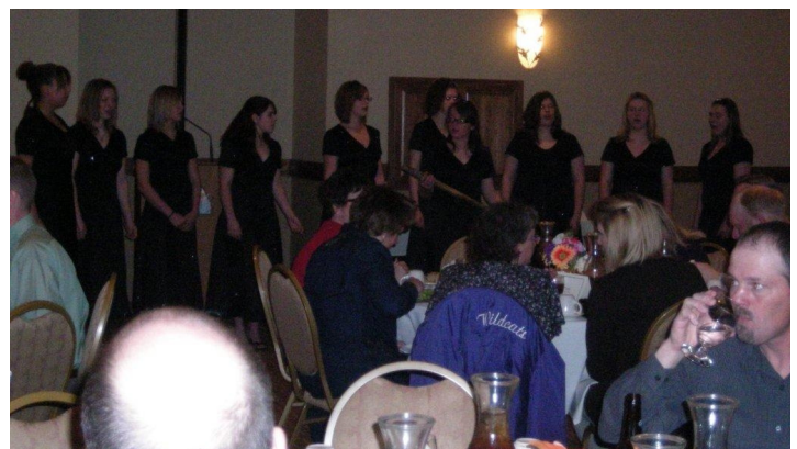
The Ell-Saline High School Singers entertain during the meal at the Cardinal Foundation Fundraiser.

Thank you for your continued trust and confidence in the Ell-Saline USD 307 school district. You can be assured that your children are receiving a quality education. Please call or stop in so we can visit about the many good things going on in your district.